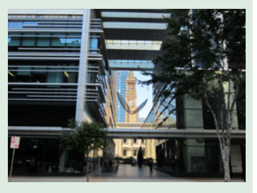
Brisbane City Hall, Brisbane (QHR 600065)

In response to a highly diverse and changed context, the careful arrangement of open space on lots adjoining creates visual 'gaps' between and through new buildings. These gaps reinforce the significant landmark status of the City Hall by constructing carefully framed views for pedestrians to glimpse the City Hall from surrounding streets. This opening up of views allows pedestrians to appreciate the landmark status of the City Hall clock tower from surrounding streets, and reinforces a contribution to sense of place in the Brisbane CBD. Similarly. new developments step down in height or are set back from the adjoining property line to allow uninterrupted views of the full length of the City Hall façade.