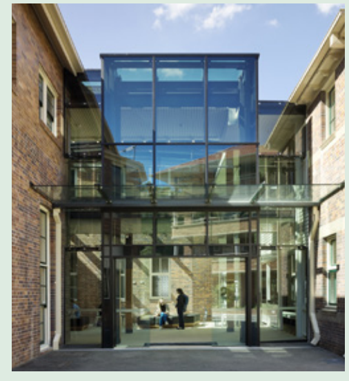
Whitty Building, Mater Hospital, South Brisbane (Brisbane City Council Heritage Register)

A key feature of the development is the insertion of a glazed atrium as a communal public space to create a campus 'hub'. Positioned within the original "butterfly" shaped layout of hospital wards, the new 'hub' is differentiated from the original building by its contemporary design and careful detailing. The new feature has been recessed behind the line of the original buildings and built of contemporary materials and finishes, minimising the impact of new building infill on the visual significance and architectural qualities of the original hospital building façade. By retaining the original courtyard layout, the hub design also informally reactivates use of the space between the two wings of the heritage building.