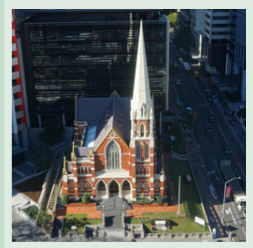
Albert Street Uniting Church, Brisbane (QHR 600066)

The scale of the new building and its finishes of clear transparent glass form a plain back drop and provide a sense of depth to space behind the church with the use of copper cladding complimenting the colour of the church brickwork.