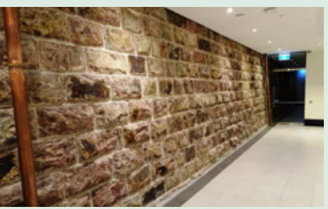
Anzac Square Memorial, Brisbane (OHR600062).