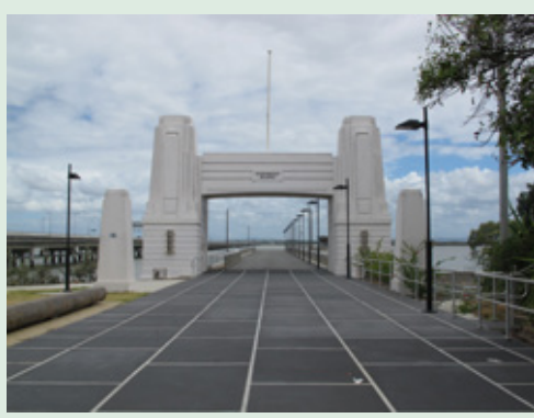
Former Hornibrook Highway Bridge Brighton (QHR 601246)