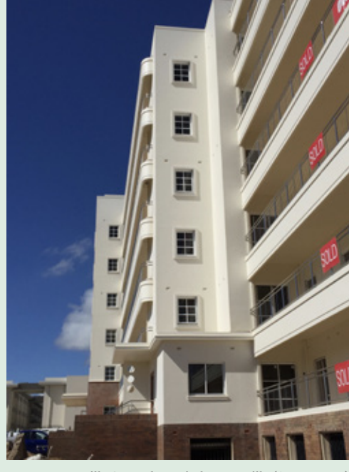
Former Townsville General Hospital, Townsville (QHR601388)

The culmination of more than a decade of work to redevelop the larger Townsville General Hospital site, the development ensures this significant building remains intact and its prominent local landmark status is preserved.