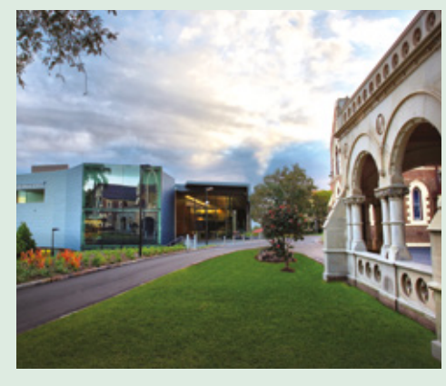
Brisbane Grammar School, Spring Hill (OHR 600124)

The eastern mirrored curtain glass wall of The Lilley Centre provides a spectacular and everchanging reflection of the historic Main Building to the street below, allowing the general public the opportunity to view and appreciate the (once previously concealed) intricate and decorative architectural façades of the School's significant heritage buildings.