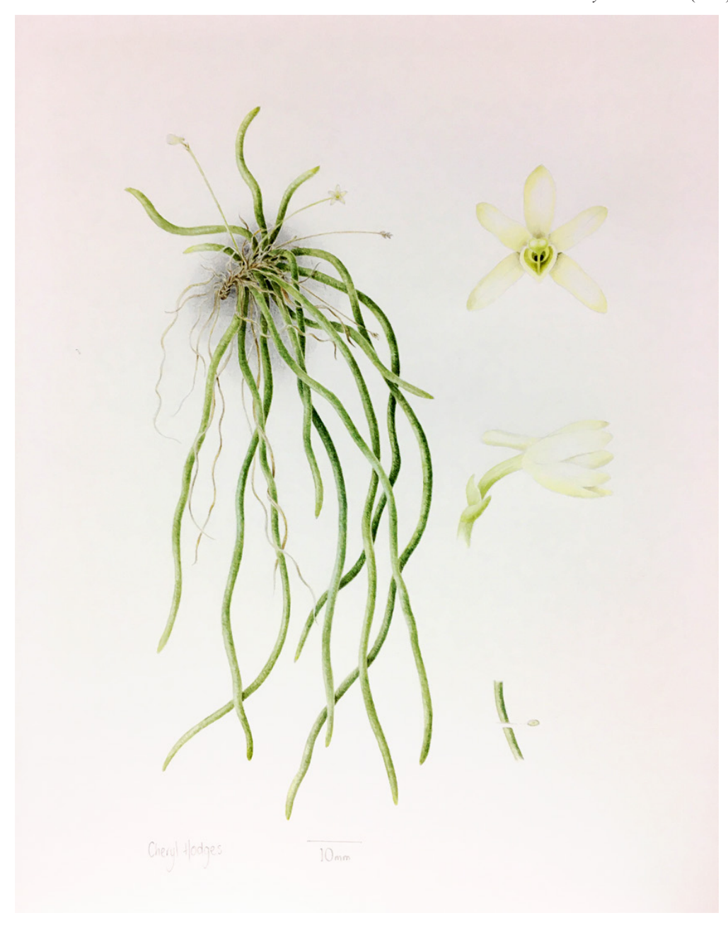
Fig. 2. Taeniophyllum cylindrocentrum. Plant; open flower front view and side view; root showing cross-section. From (mostly) Clarkson 2436 (BRI). Del. Cheryl Hodges.