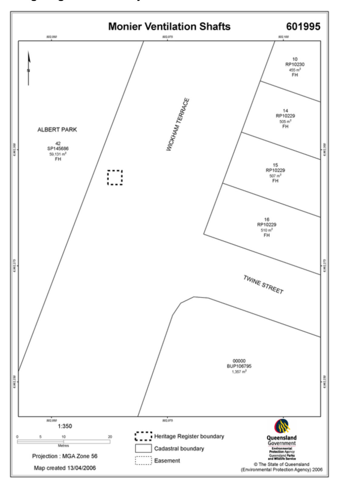
Figure 4: Monier Ventilation Shaft 1 (Spring Hill) - boundary map (2006)