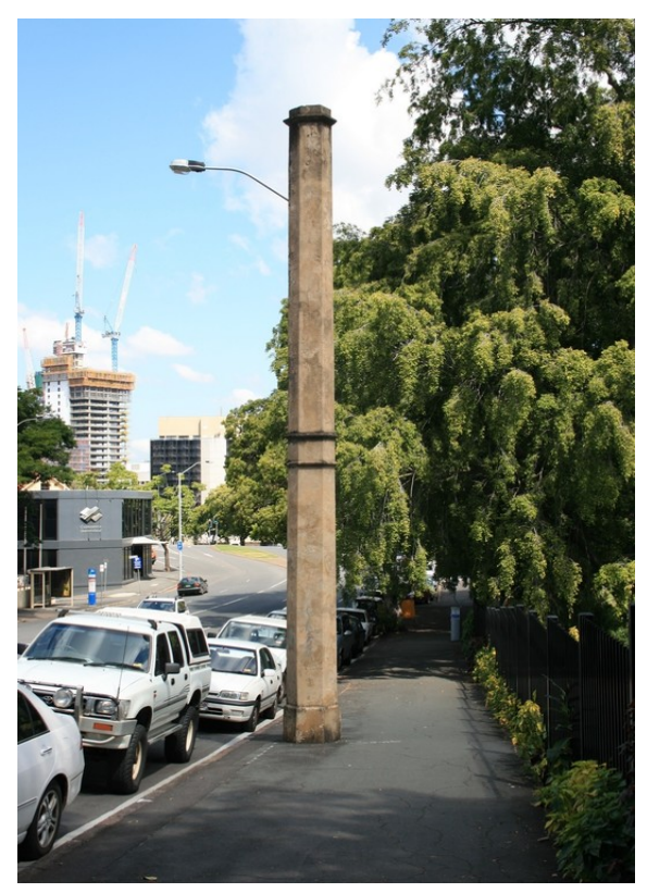
Figure 2: Monier Ventilation Shaft 1 (Spring Hill) (2008)