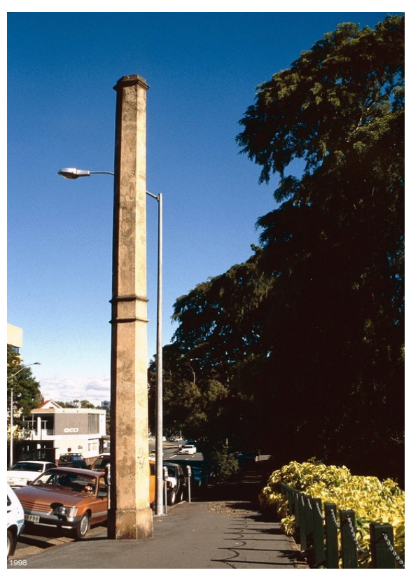
Figure 3: Monier Ventilation Shaft 1 (Spring Hill) (1998)