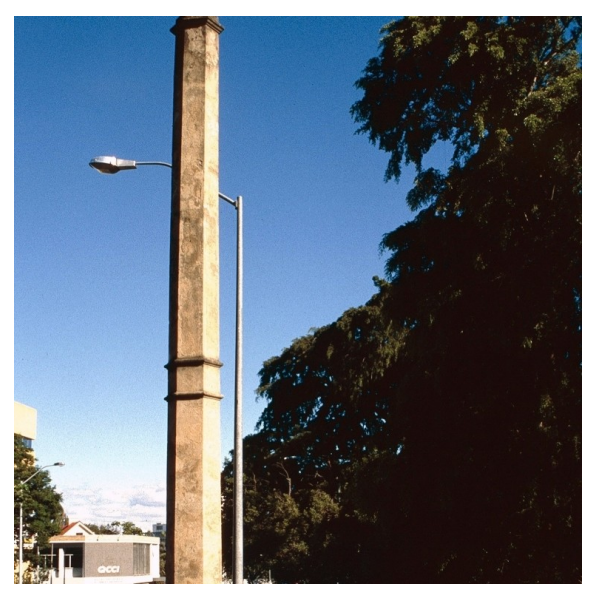
Figure 1: Monier Ventilation Shaft 1 (Spring Hill) (1998)