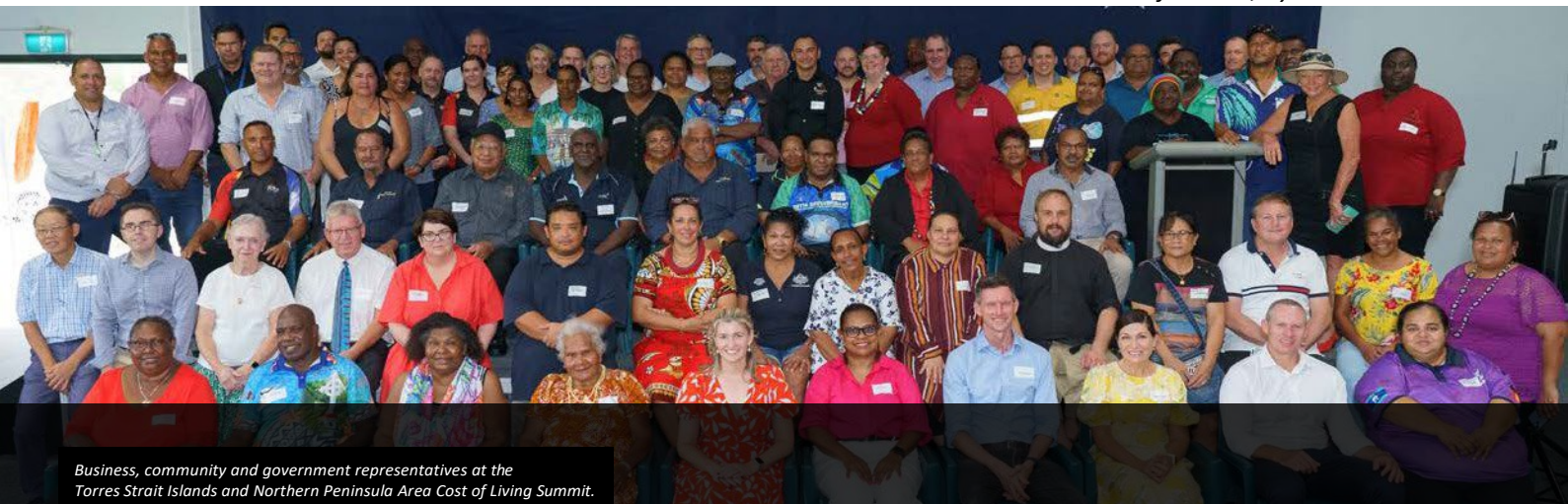
Business, community and government representatives at the Torres Strait Islands and Northern Peninsula Area Cost of Living Summit.