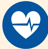
Medical monitoring devices to wear