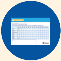
You will be asked to monitor and record your daily symptoms