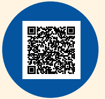
Download our symptom diary here