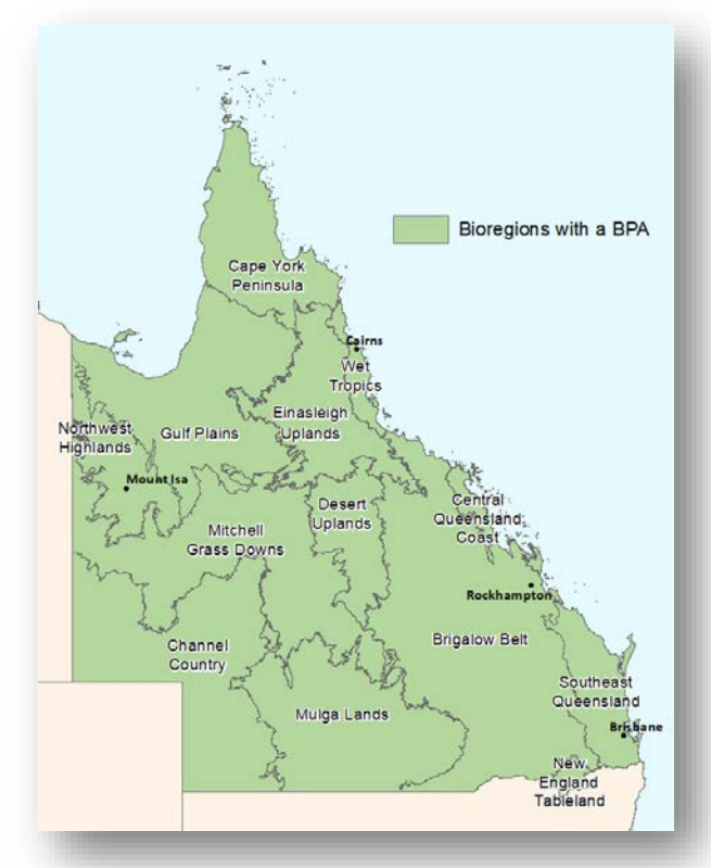
Figure 3 BPA assessment and release status

Queries to biodiversity.planning@des.qld.gov.au